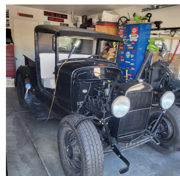
Almost ready for a test drive around the block to check out the work so far!