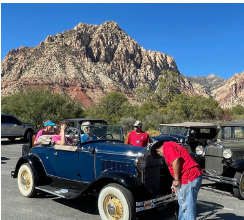
THE PREZ GIVES IT A TRY