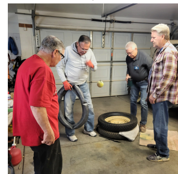
Oh, Crap, we pinched the new tube!