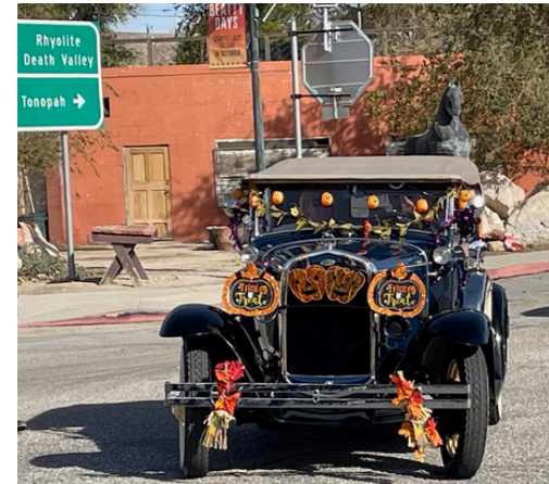
RINGENBACH'S ON PARADE