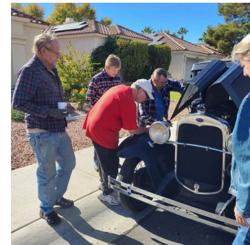
Looks like a float valve sealing issue!