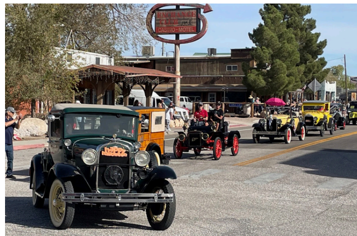
3 - 1st place Awards for this great looking group!