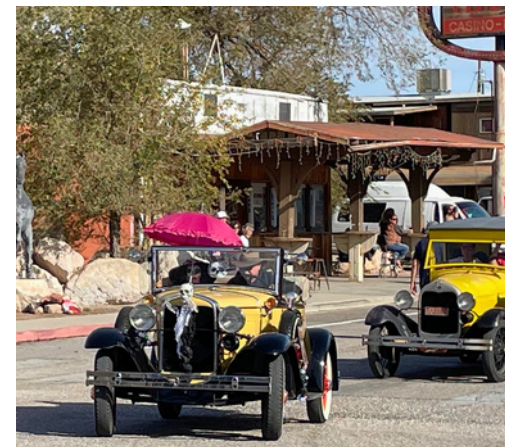
JOHNSON'S & WHITE'S ON PARADE

THE ANNUAL A & T PICNIC IS ALWAYS TESTING THE DRIVING SKILLS OF OUR MEMBERS MORE PHOTOS PAGE 9