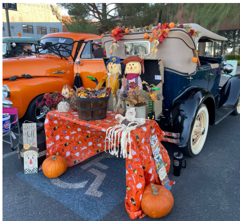
RINGENBACHS AND FICCHINOS DECORATED READY FOR THE KIDS MORE PHOTOS ON PAGE 7