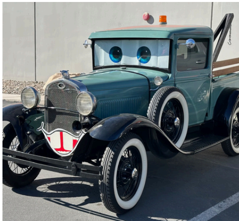
MIKE CREATED TOW-MATER'S DAD!