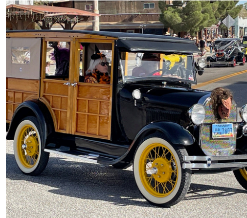
THE ROY'S FIRST BEATTY DAYS